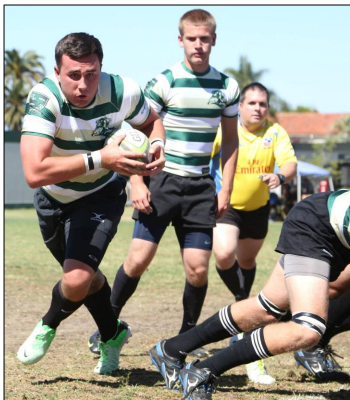
PLNU vs. SDSU 10–12–13