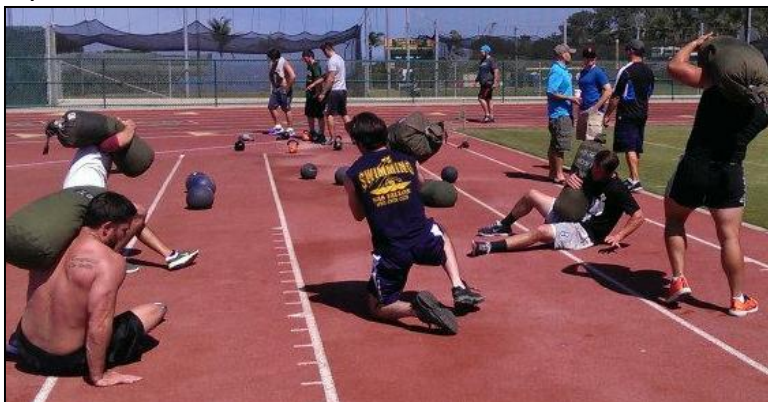
Sandbags and Sprints on a beautiful Saturday morning on campus

I hope you will come support the club at a match near you!